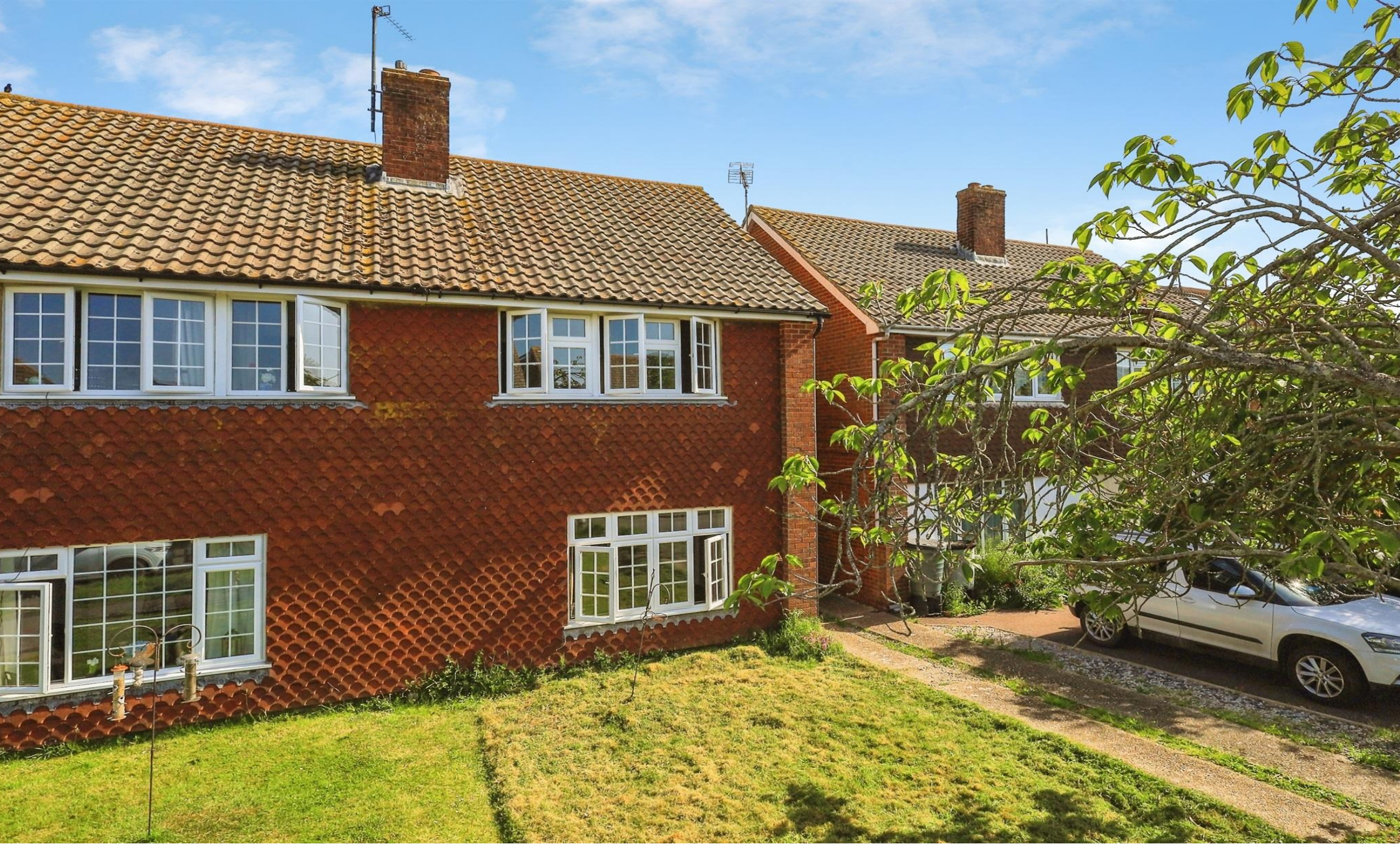
Foxglove Close, Ringmer Lewes BN8 5PB