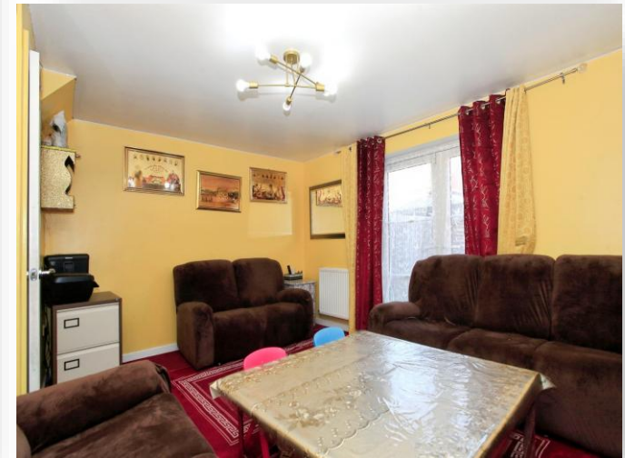
Apricot Close, Peterborough PE1 4FY