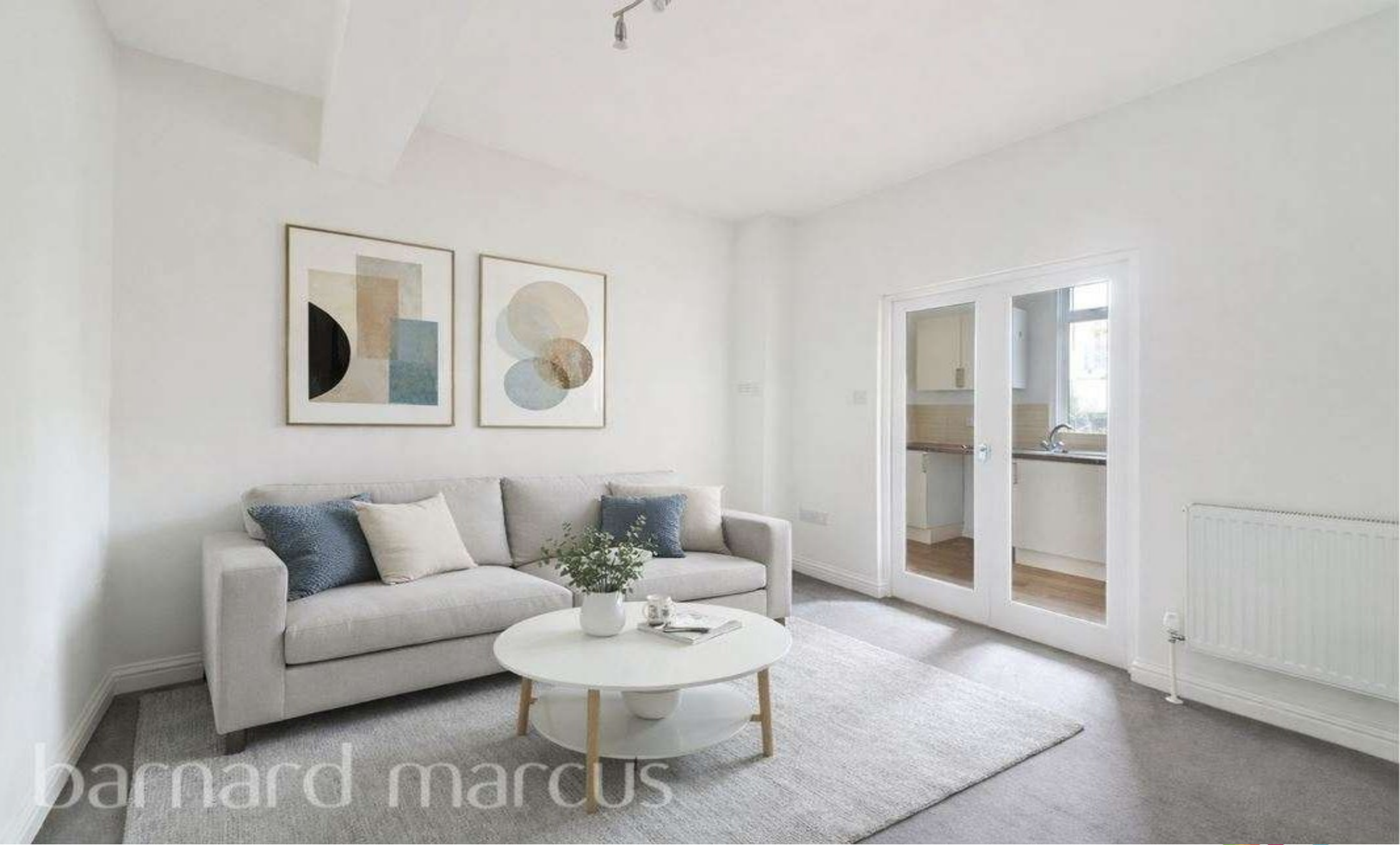
First Floor Flat Oval Road, Croydon CR0 6BQ