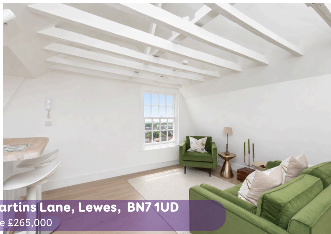
Castle View Apartments, St. Martins Lane, Lewes, BN7 1UD Asking Price £265,000