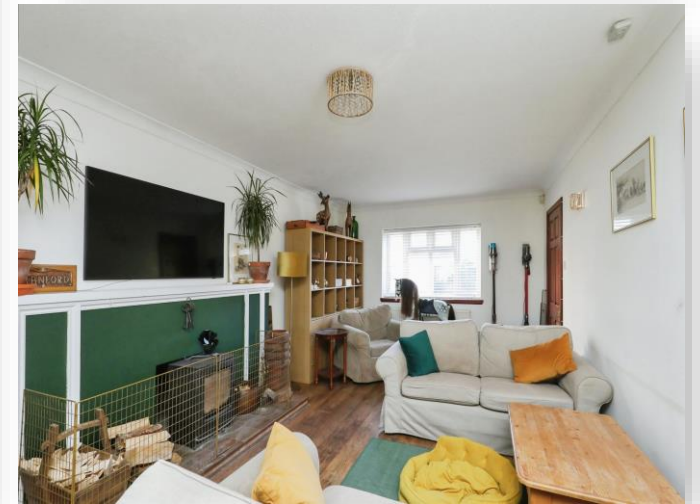
London Street, Swaffham, PE37 7DJ