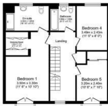
First Floor Floor area 59.8 sq.m. (644 sq.ft.)