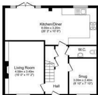
Ground Floor Floor area 59.8 sq.m. (644 sq.ft.)