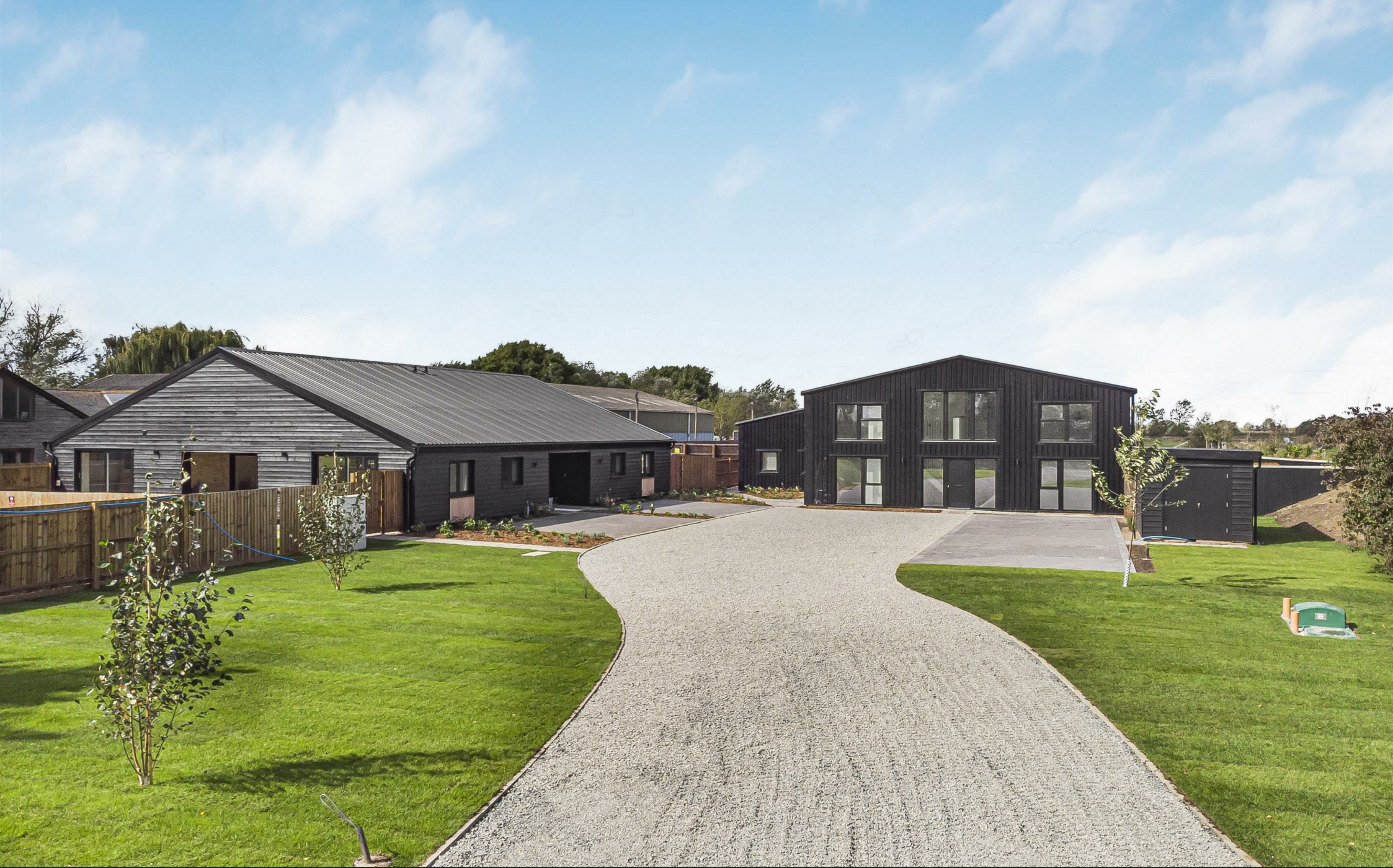
Stable Yard, Lode Fen, Lode, CB25 9HF