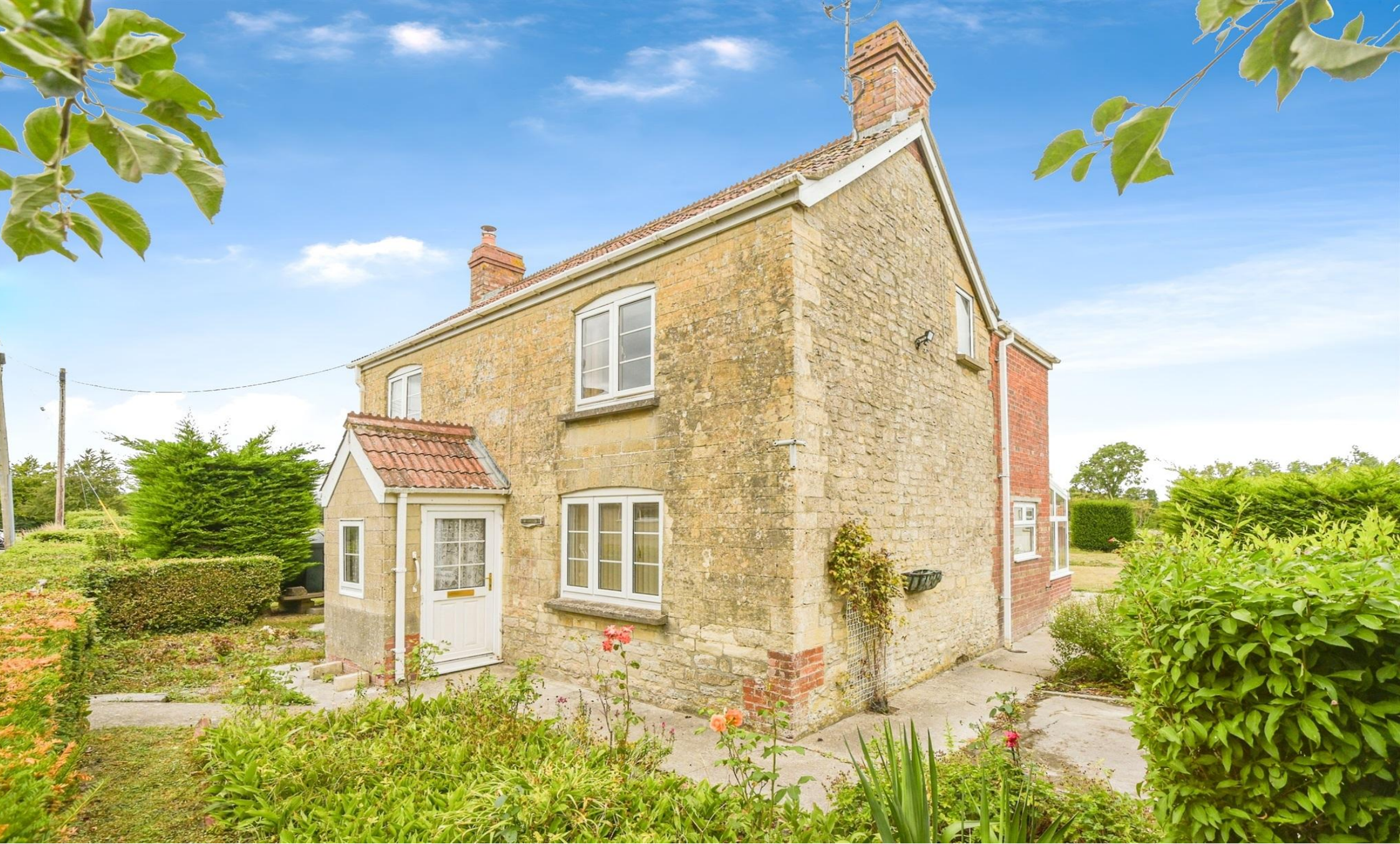
Ivy Cottage Blackland Crossroads, Blackland Calne SN11 8PU