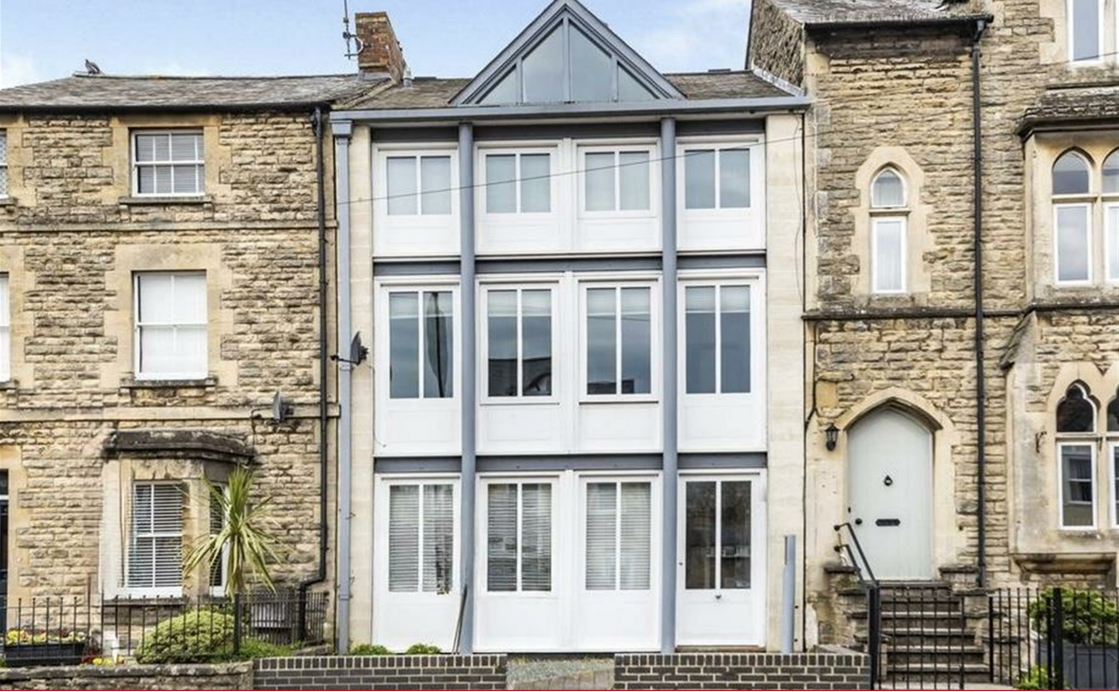
Apartment 3, West Lodge, Victoria Road, Cirencester, GL7 1EN Asking Price £180,000