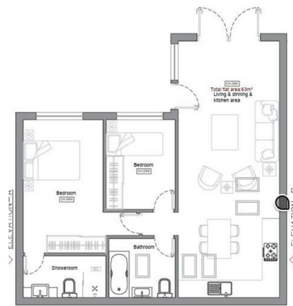
PROPOSED GROUND FLOOR PLAN SCALE 1:50