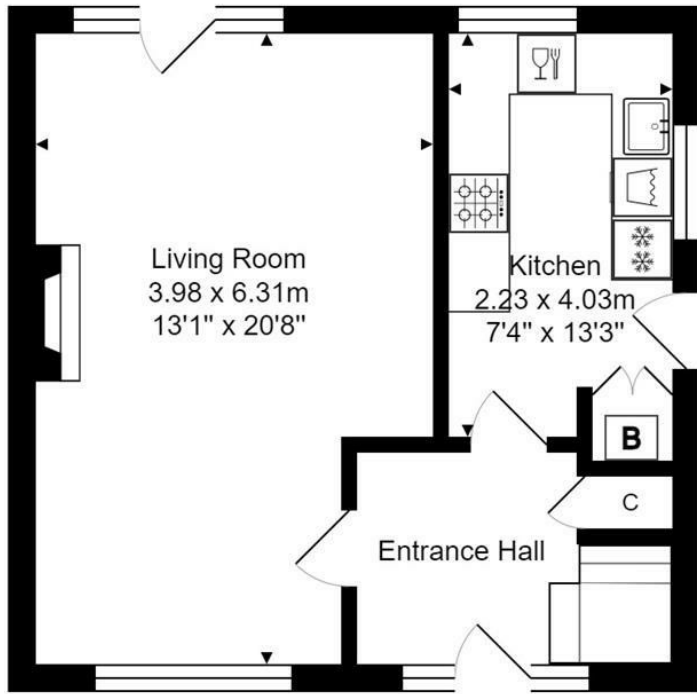
Ground Floor Area: 40.3 m 2 ... 434 ft 2