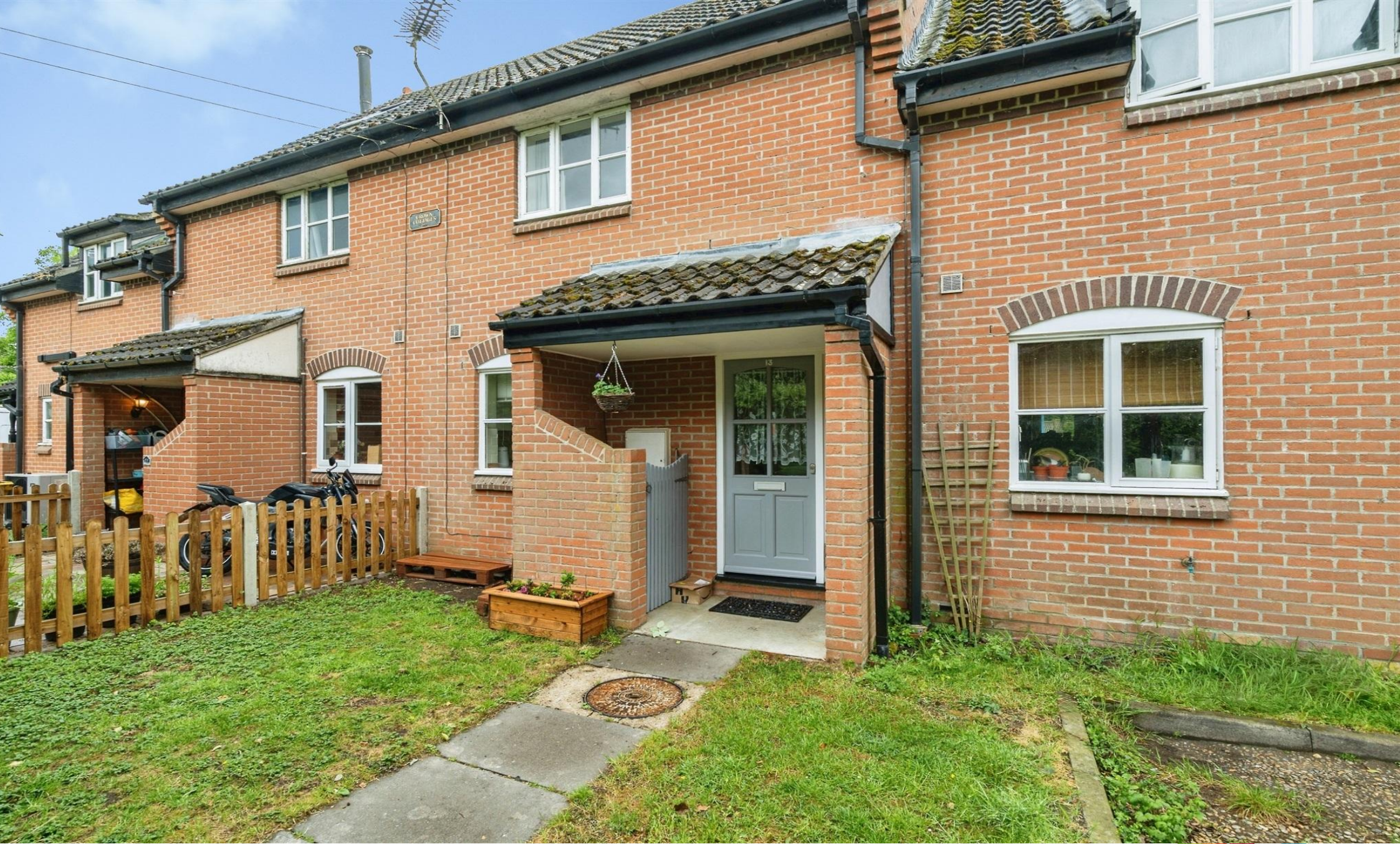
Crown Cottages Mill Green, Burston Diss IP22 5TJ