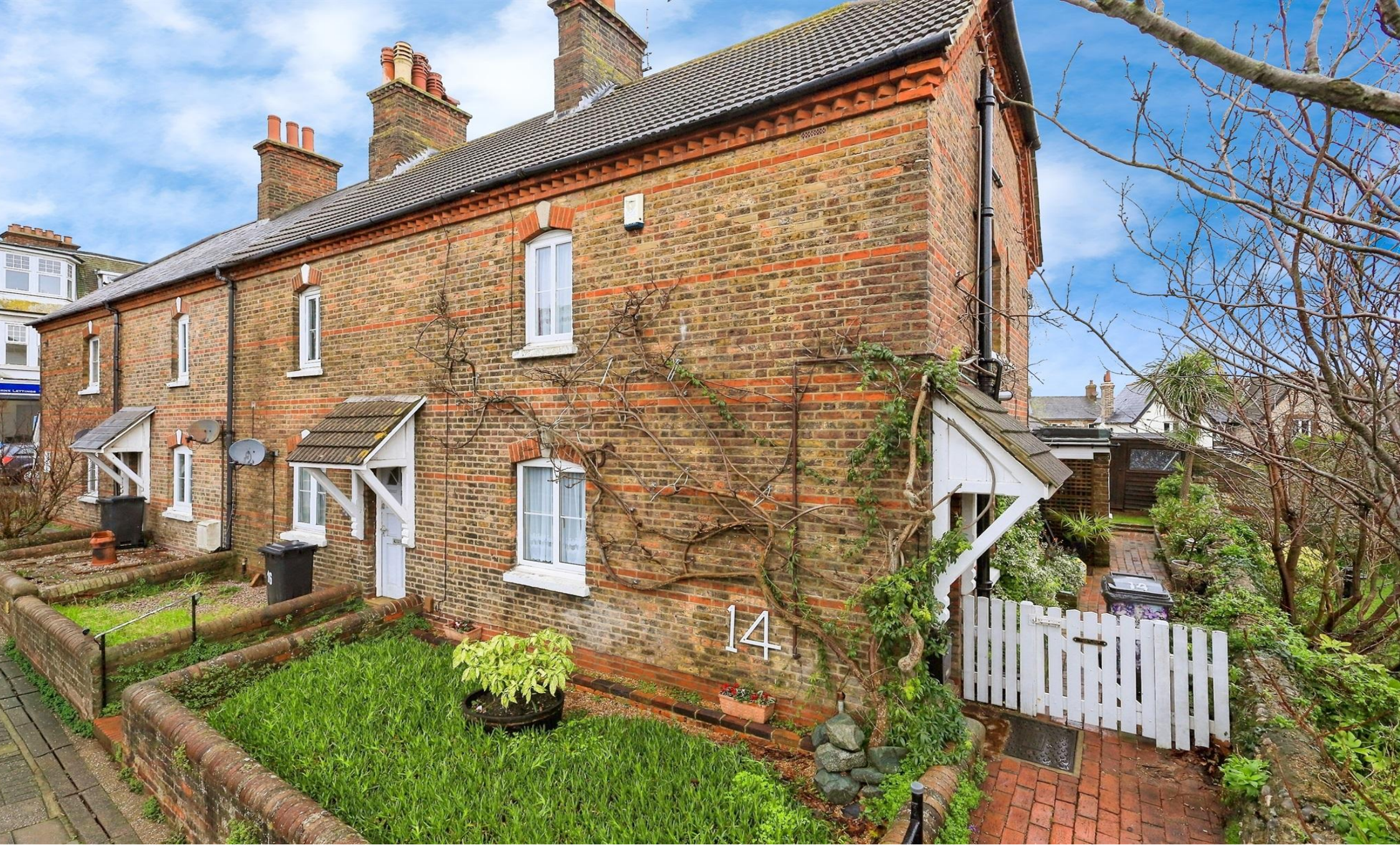
Church Street, Old Town Eastbourne BN21 1HT