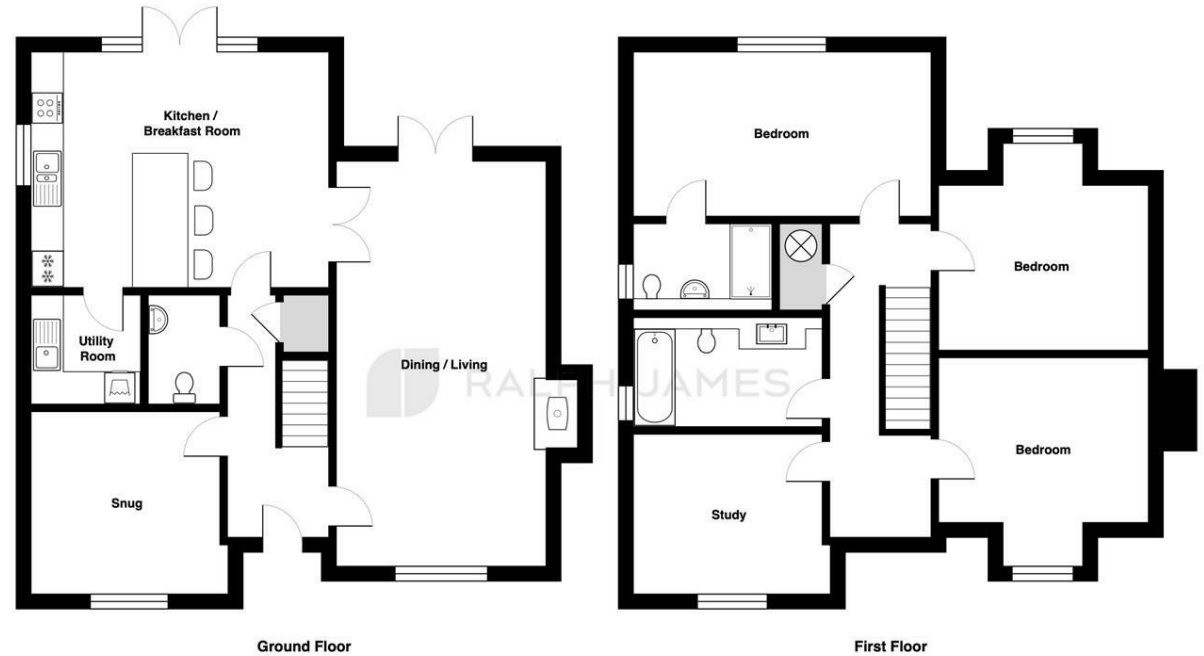
Plot 1 - Bechwood, Boxhill Road, Box Hill