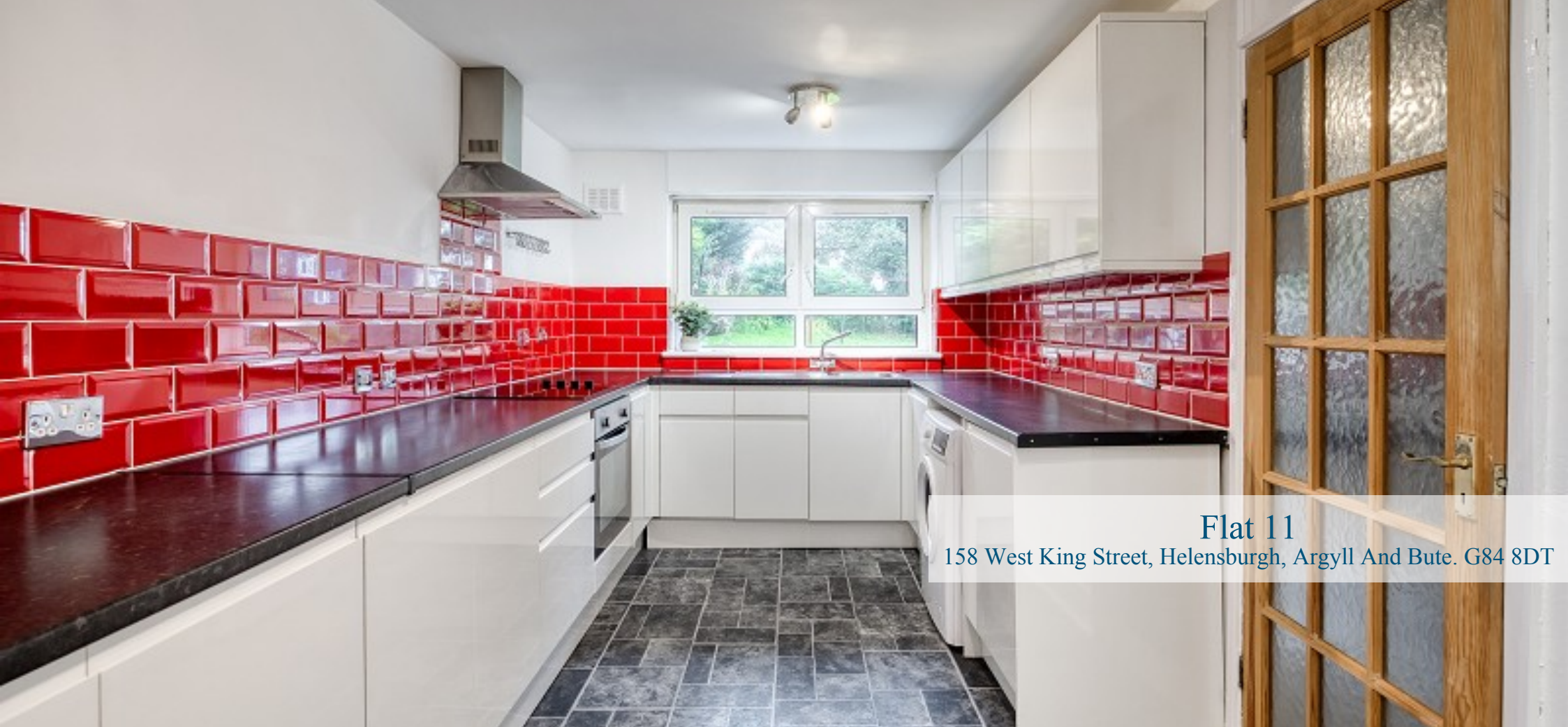
Flat 11 158 West King Street, Helensburgh, Argyll And Bute. G84 8DT