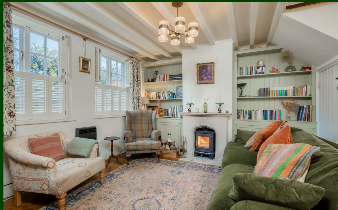
1 Church Street Charlbury Oxfordshire OX7 3PW Telephone: 01608 811146