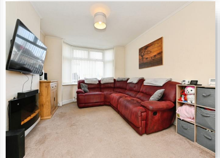
Old Lynn Road, Wisbech PE13 3SB