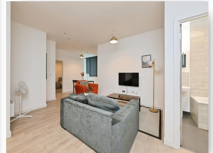
Bayard Apartments Broadway, Peterborough PE1 1RT