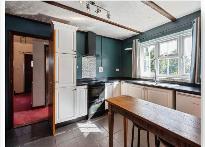
The Street, Holywell Row IP28 8LS