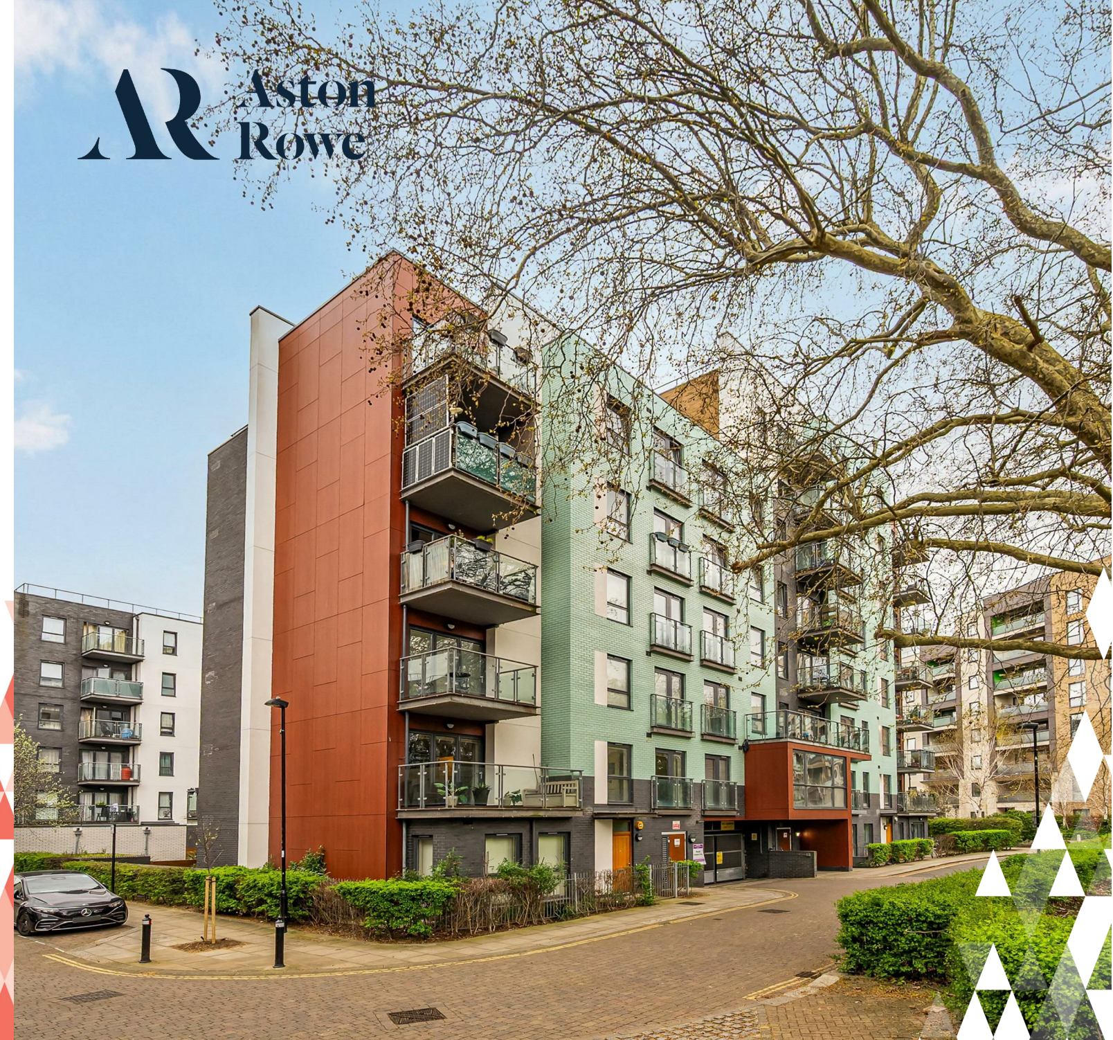
Chaplin House Approximate Gross Internal Area = 89.1 sq m / 959 sq ft