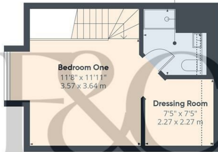
Floor 2 Building 1