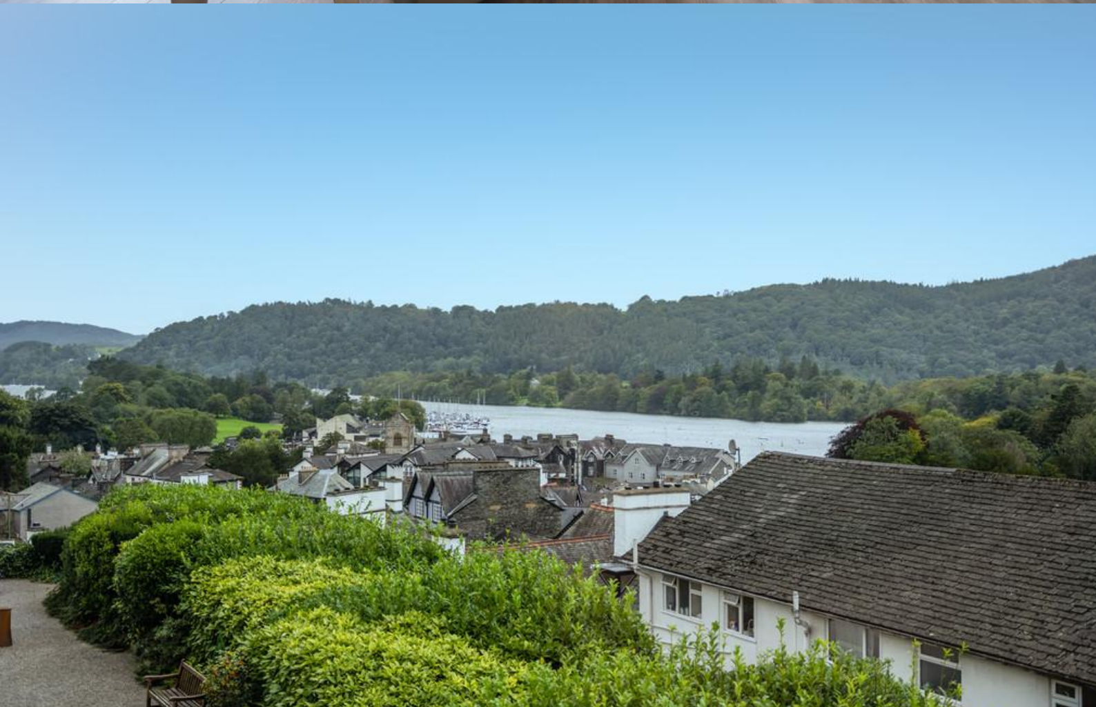
View of Lake Windermere