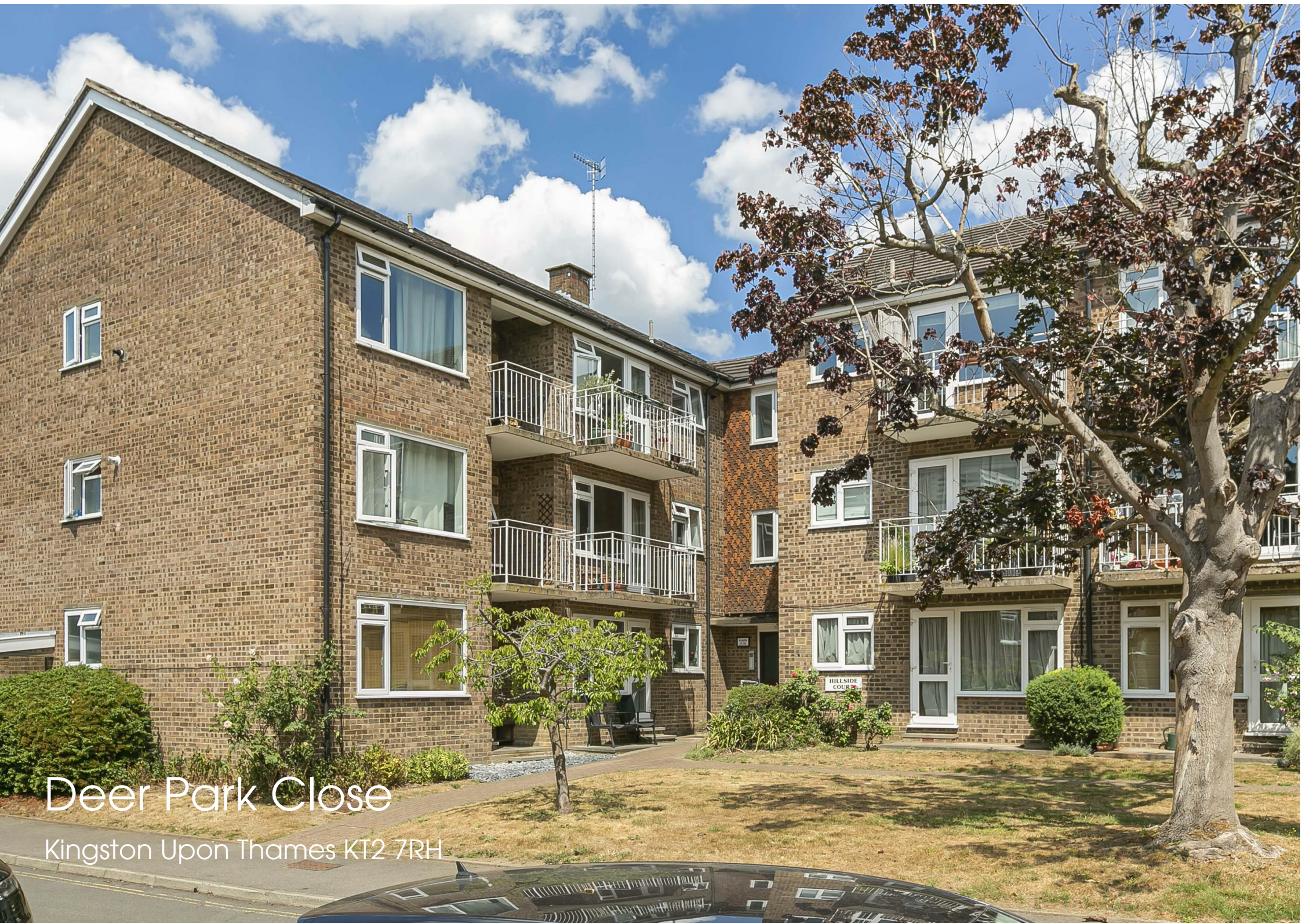
Deer Park Close Kingston upon Thames KT2 7RH

34 Richmond Road Kingston upon Thames Surrey KT2 5ED www.gibsonlane.co.uk Tel: 020 8546 5444