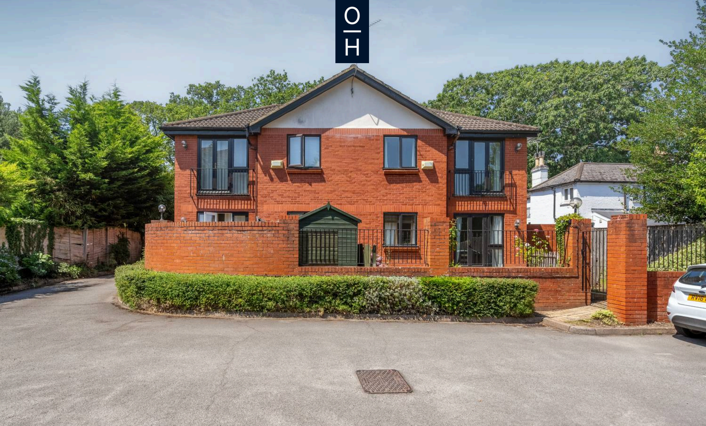
Sunninghill Lodge, 9 Upper Village Road £1,250 pcm