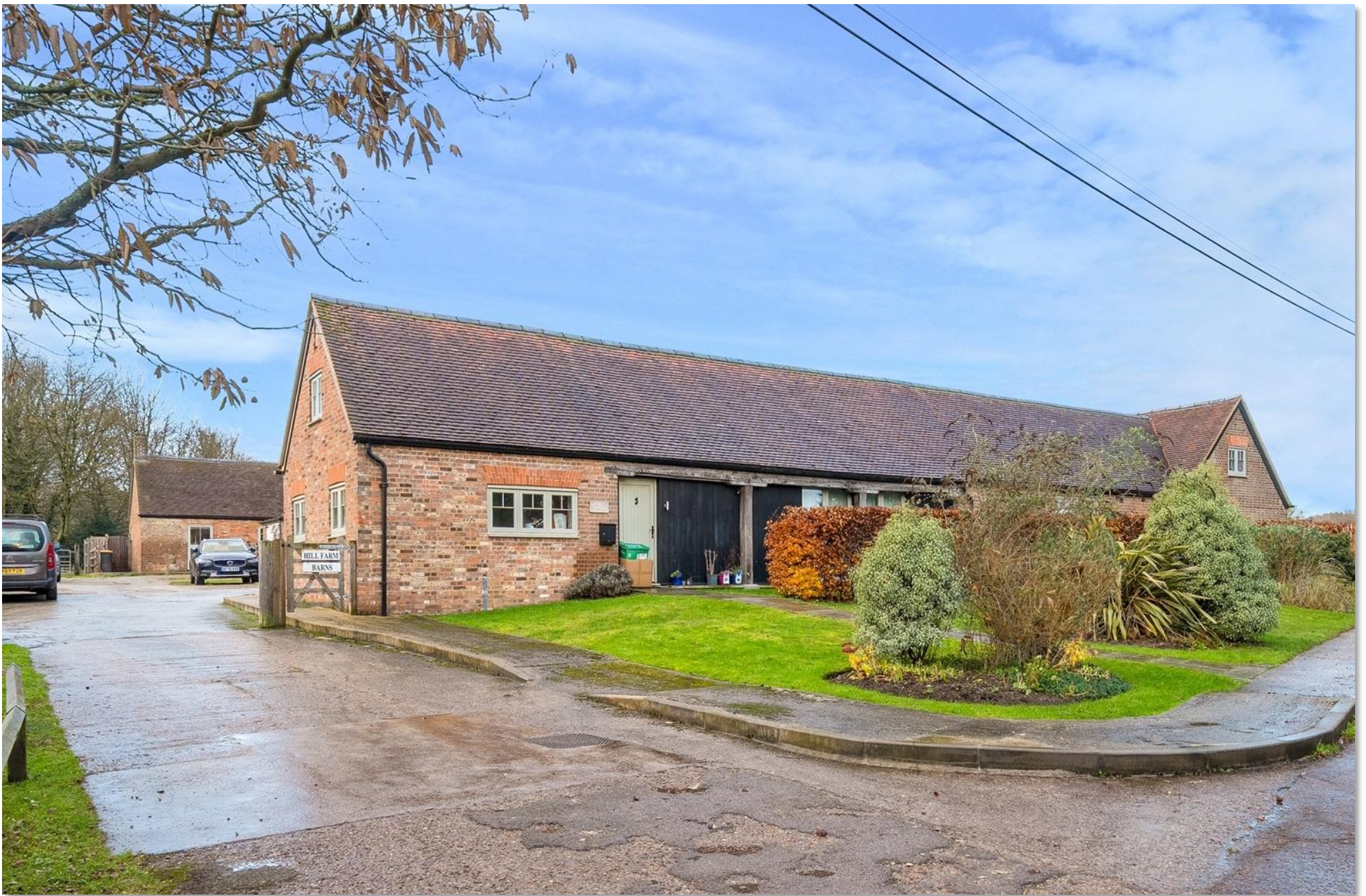
Haycroft Hill Farm Barns, Whipsnade Dunstable LU6 2LN