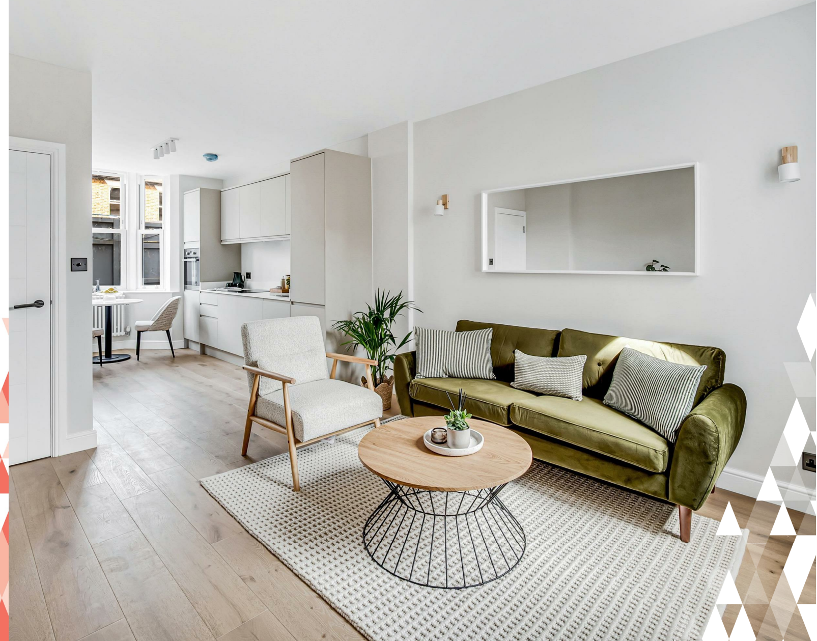
Mill Hill Road Approximate Gross Internal Area = 59.7 sq m / 642 sq ft