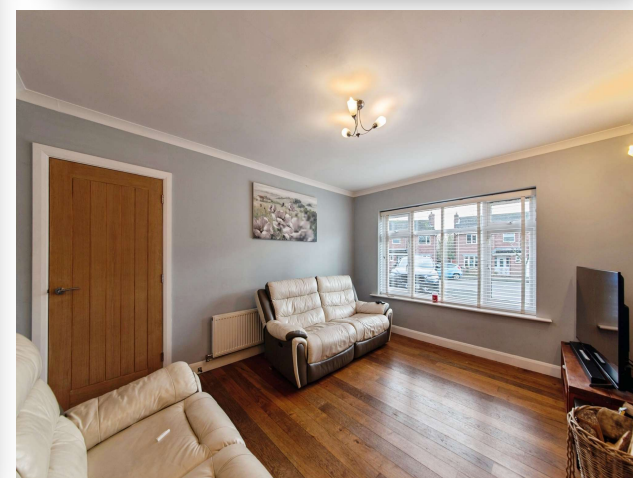
Wyatt Close, Martin Lincoln LN4 3RN