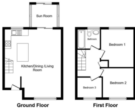
Total floor area 74.0 sq. m. (797 sq. ft.) approx This floor plan is for illustrative purposes only. It is not drawn to scale. Any measurements, floor areas (including any total floor area), openings and orientation are approximate. No details are guaranteed. They cannot be relied upon for any purpose and they do not form part of any agreement. No liability is taken for any error, omission or misstatement. A party must rely upon its own inspection(s). Plan produced for Your Move, Powered by www.flooragart.com