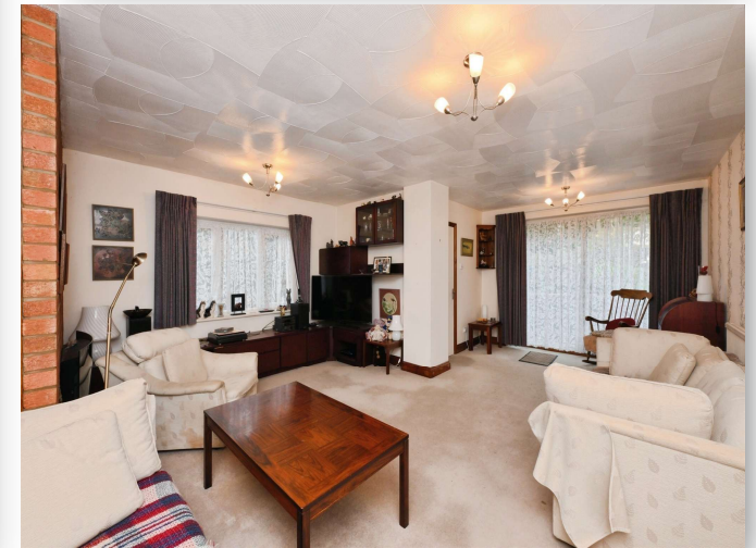
Vicarage Road, WARE SG12 7AP