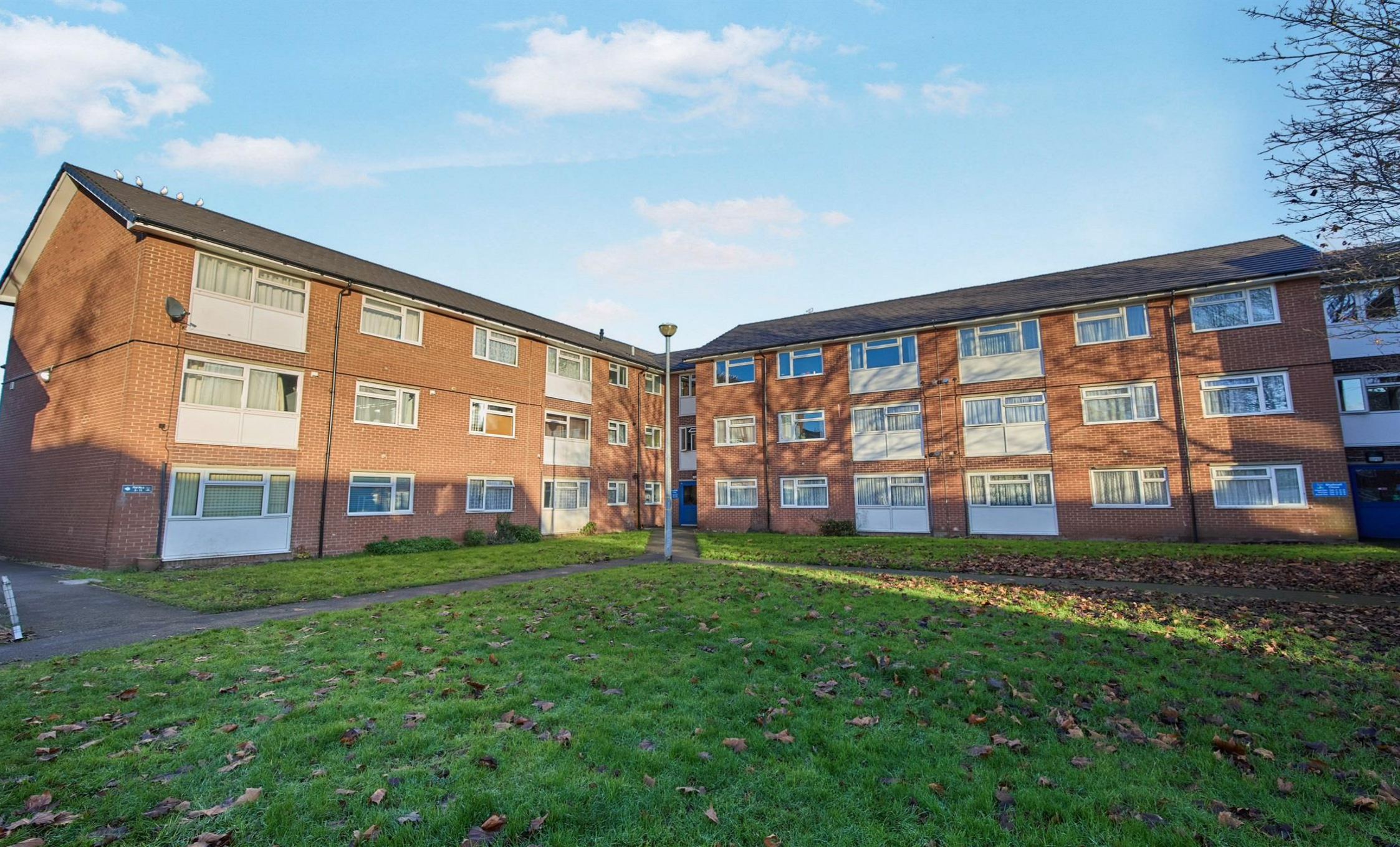
Shobnall Close, BURTON-ON-TRENT