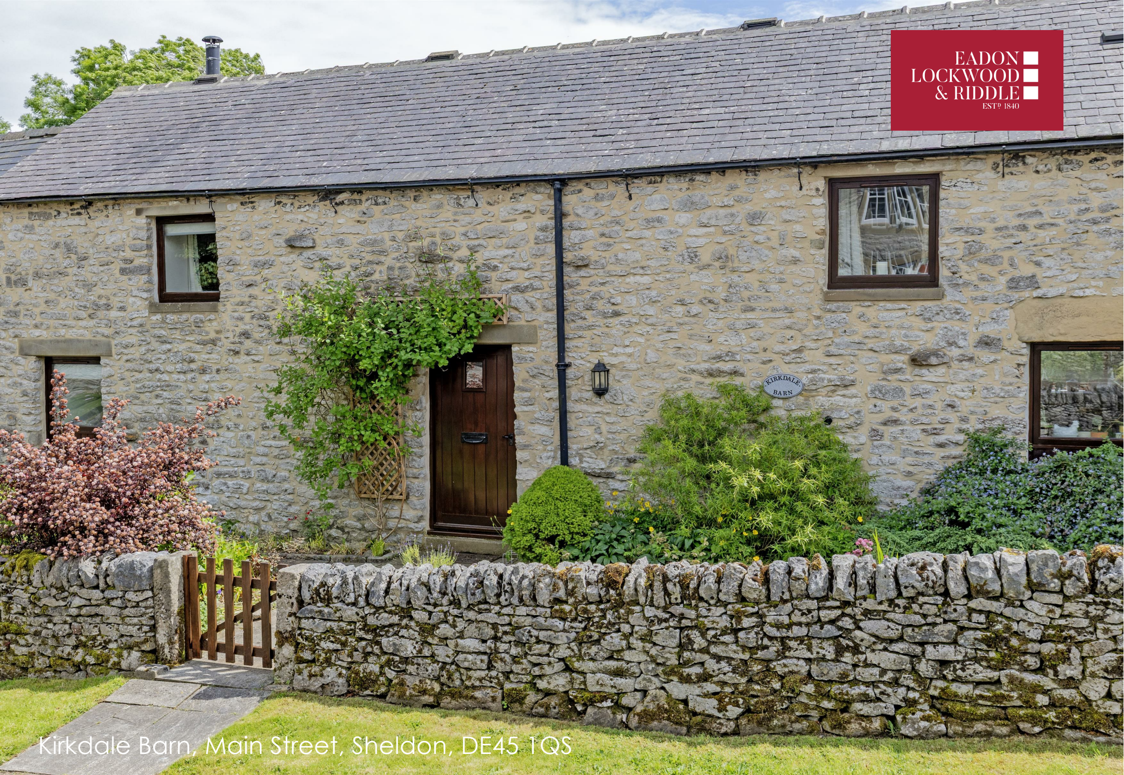
Kirkdale Barn, Main Street, Sheldon, DE45 1QS