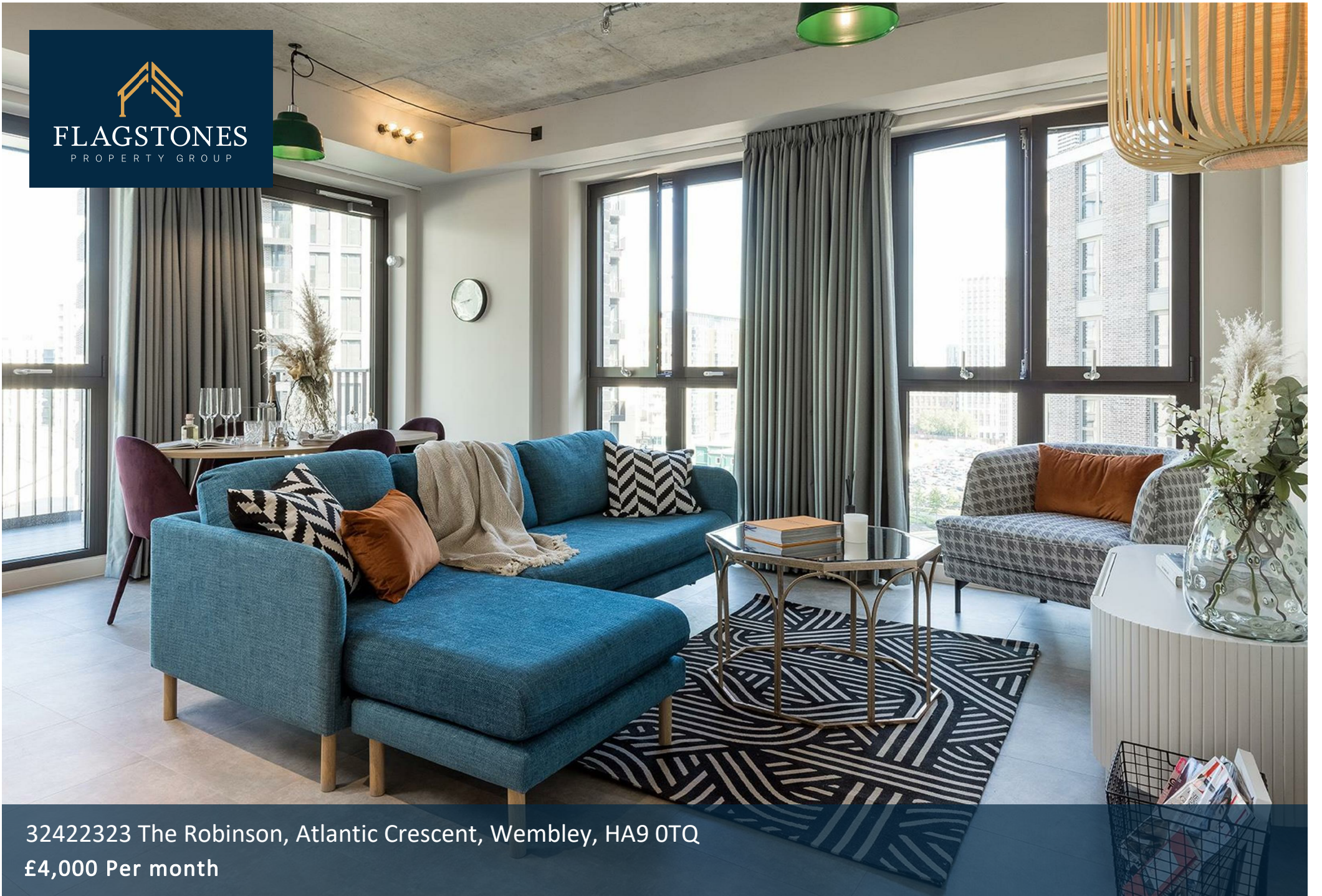
32422323 The Robinson, Atlantic Crescent, Wembley, HA9 0TQ £4,000 Per month