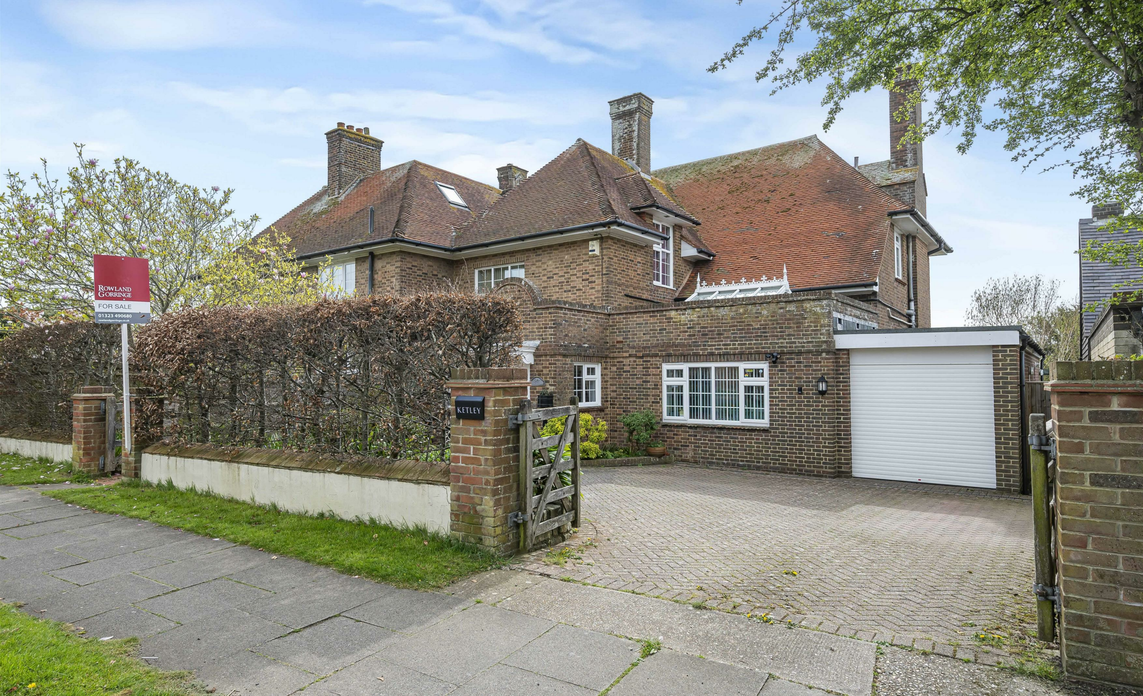
Ketley Upper Belgrave Road, Seaford, BN25 3AD