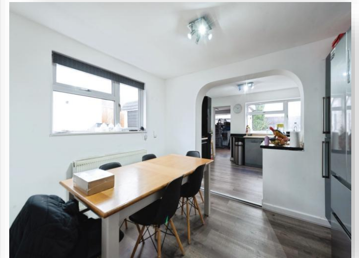
Bernina Avenue, Waterloooville PO7 6XQ