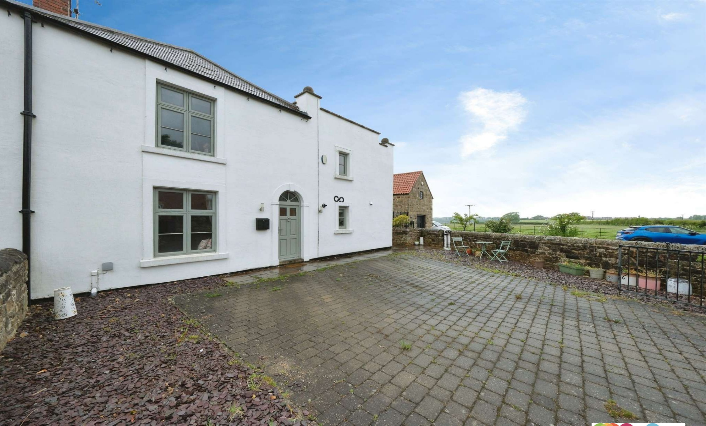
The Annex Castle View, Palterton Chesterfield S44 6UQ