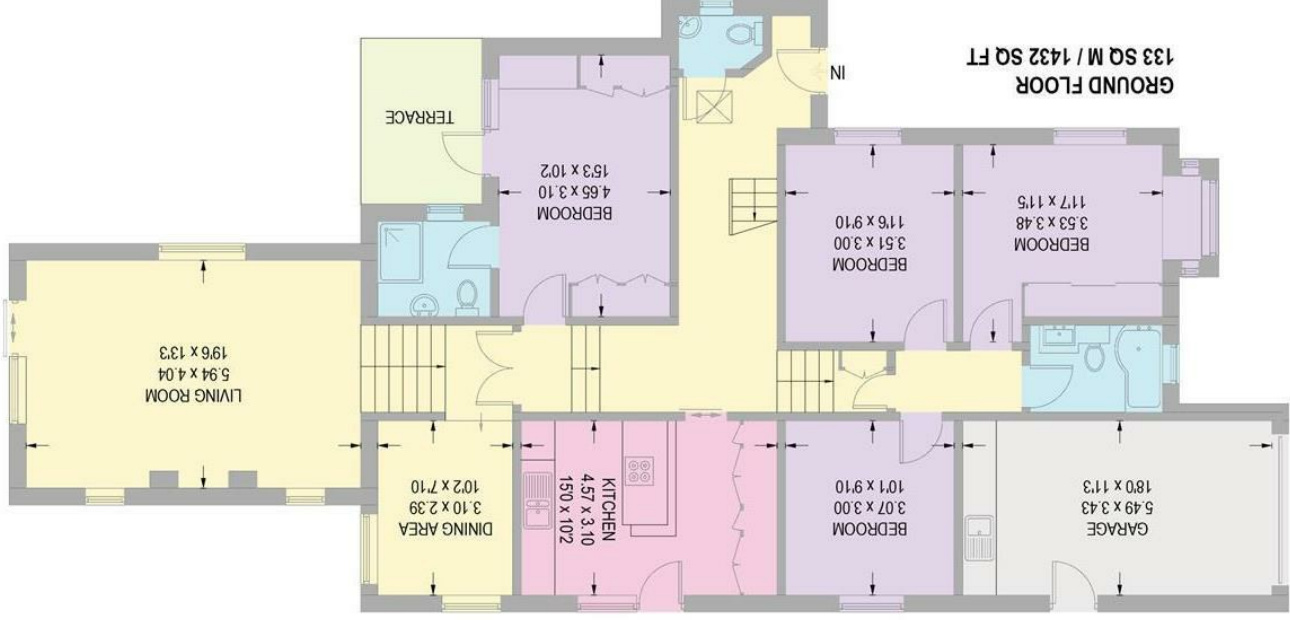
Illustration for identification purposes only. measurements are approximate, not to scale.

While we endeavour to make our sales particulars fair, accurate and reliable, they are only a general guide to the property and, accordingly, if there is any point, which is of particular importance to you, please contact the relevant office. The Agents have not tested any apparatus, equipment, fittings or services and so cannot verify they are in working order. The buyer is advised to obtain verification. Please note all the measurement details are approximate and should not be relied upon as exact. All plans, floor plans and maps are for guidance purposes only and are not to scale. Under no circumstances should they be relied upon as exact or for use in planning carpets and other such fixtures, fittings or furnishings. YOUR HOME IS AT RISK IF YOU DO NOT KEEP UP REPAYMENTS ON A MORTGAGE OR OTHER LOAN SECURED ON IT. A Life Assurance policy may be requested. Written Quotations of credit terms available on request.