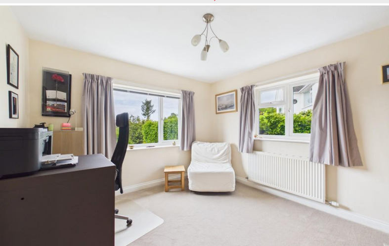
Bedroom Four / Home Office