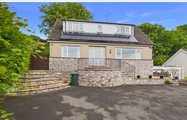
10 Clevelands Avenue

Energy Performance Certificate The full Energy Performance Certificate is available on our website and also at any of our offices.