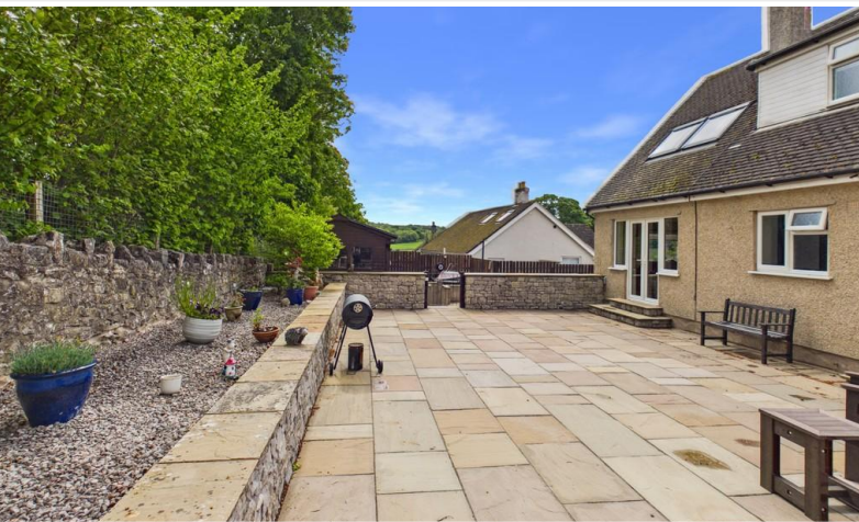
Rear Patio Garden