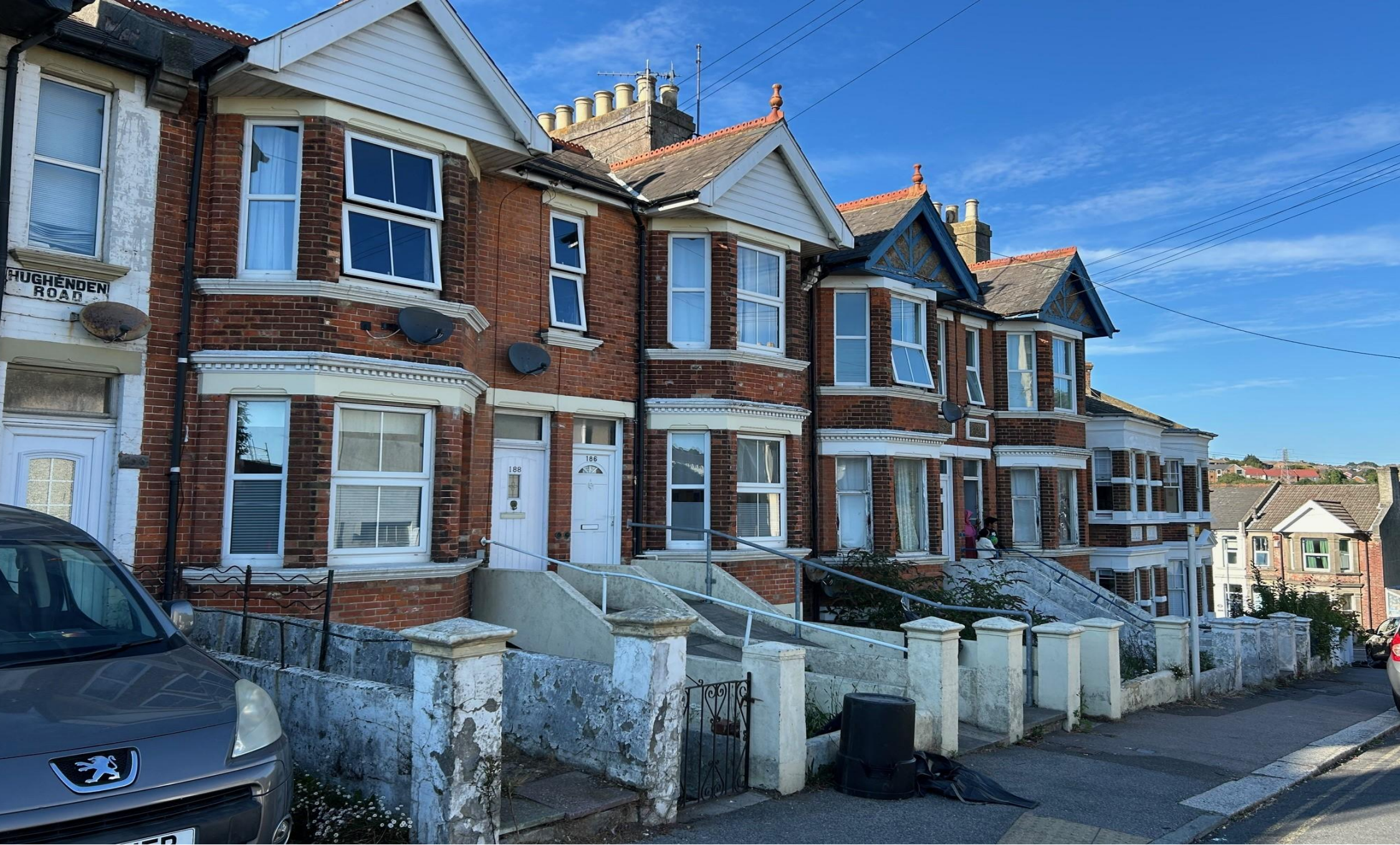
Hughenden Road, Hastings TN34 3TA