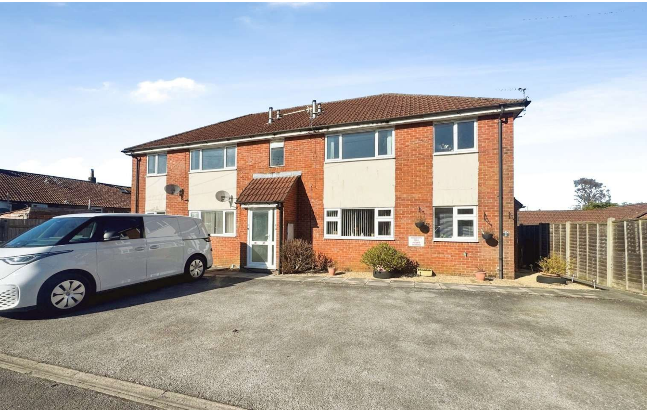
West Parade, Warminster