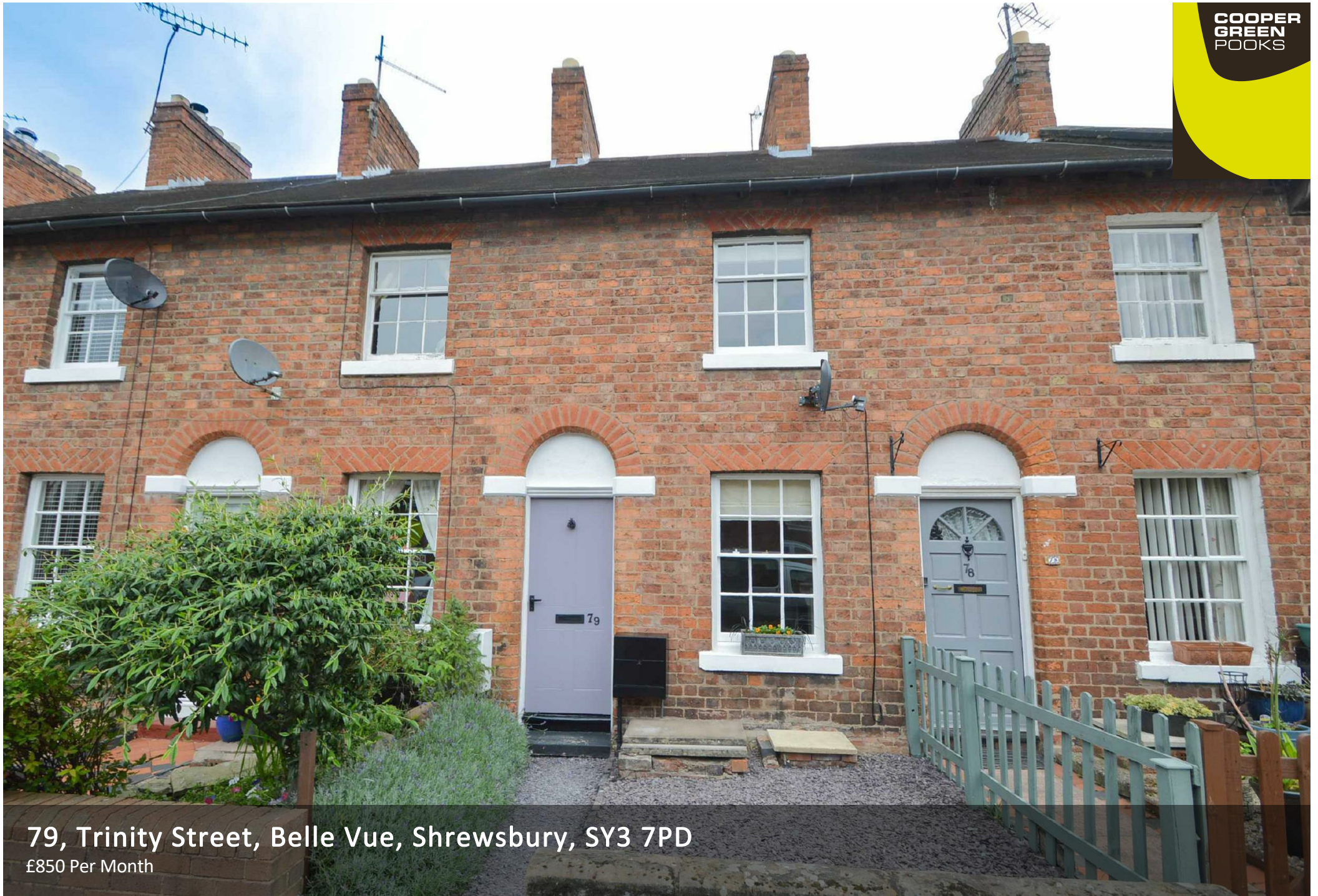
79, Trinity Street, Belle Vue, Shrewsbury, SY3 7PD £850 Per Month