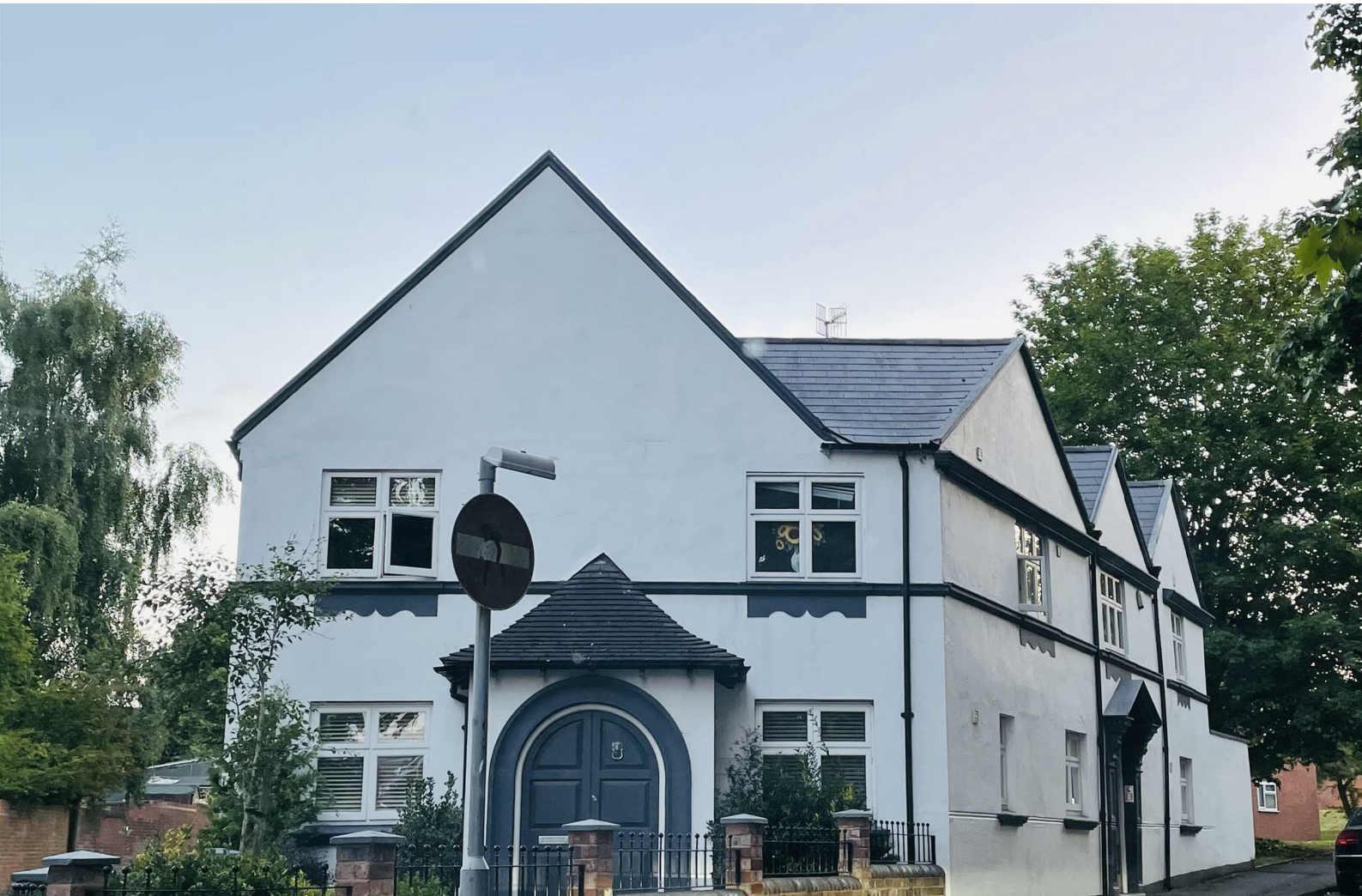
Flat 2 Red Lion House, Stourbridge, DY8 1BW