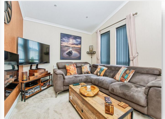
Oakdale Place A47, Elm, WISBECH, PE14 0EN