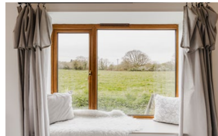
Sitting Room Countryside Views

“Views over open farmland create a wonderfully calm, everyday backdrop.”