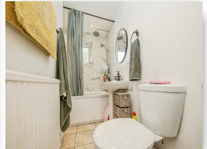
Lacey Street, Ipswich, IP4 2PL