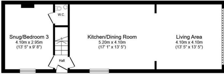
Ground Floor Floor area 53.0 sq.m. (570 sq.ft.)