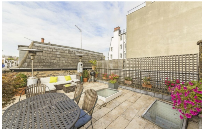
Kensington Church Street, W8