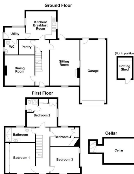
Not to scale. For illustrative purposes only

West Northamptonshire Council Tax Band E