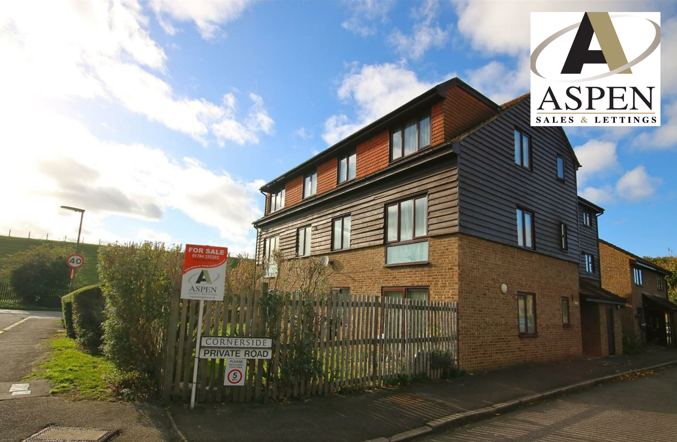
14 Cornerside, Ashford, TW15 1UY