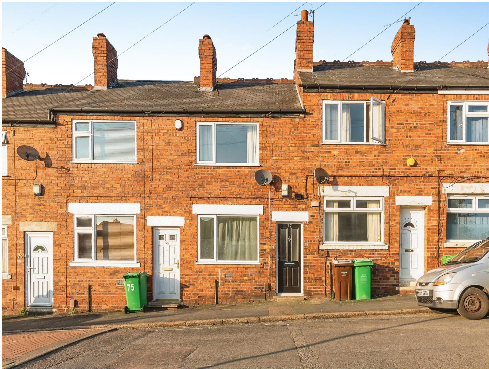
Gladstone Street, Nottingham NG7 6GU