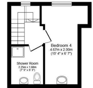
Second Floor Floor area 19.0 sq.m. (205 sq.ft.)

Total floor area: 109.3 sq.m. (1,176 sq.ft.)