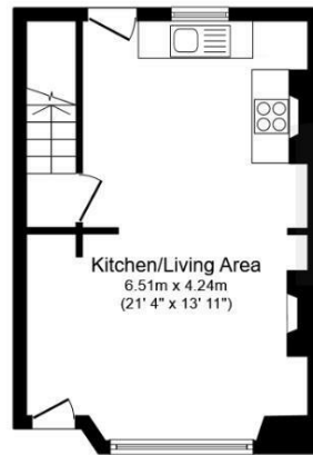
Lower Ground Floor Floor area 30.1 sq.m. (324 sq.ft.)

Situated in the desirable Poets Corner district, this property is just moments from Portland Road, a vibrant high street brimming with independent cafés, boutique shops, and essential amenities. Commuters will appreciate the proximity to Aldrington and Hove railway stations, providing swift connections to Brighton, Gatwick Airport, and London. Families will also benefit from nearby well-regarded schools and the lovely Stoneham Park, which features green spaces and a community café. The scenic Hove seafront is within easy reach, offering delightful walks and leisure activities. This property truly represents a wonderful opportunity for family living in a vibrant community.